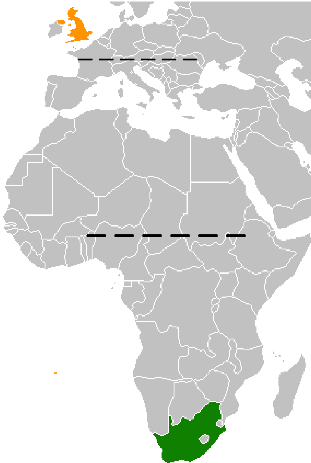
Map: Credit By Discott http://gunn.co.nz/map/