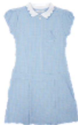
Blue Gingham Summer Dress