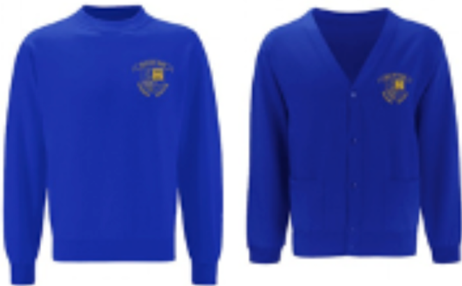
Royal Blue Jumper/Cardigan/Fleece

Please see below pictures of our school uniform. The school logo on items is optional. We do ask that you name all the uniform including coats and hats etc. You may wish to purchase trainer style footwear instead of traditional school shoes, but we do ask wherever possible that these are black and without prominent logos.