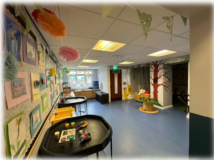
Shared area and quiet area