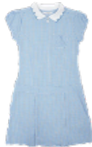
Blue gingham dress