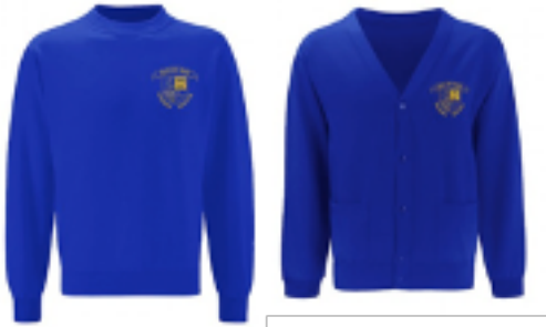
Royal blue jumpers and/or cardigans

Please see our uniform below (school logos optional).