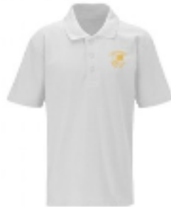
White Polo Shirt