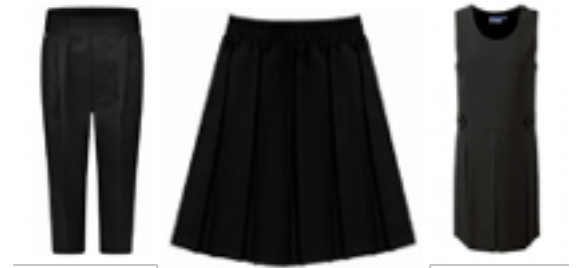
Black trousers, skirt and/or pinafore